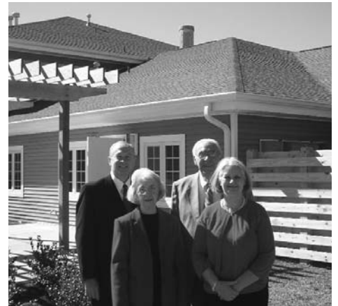
Open House at Anderson-Fischer Apartments held February 6-7, 2009

Anderson-Fischer Apartments, a new, wheelchair accessible affordable apartment community in Mobile is now open offering nineteen wheelchair accessible apartments to very low income households with Traumatic Brain Injury or other physical disability. Sponsored by the Alabama Head Injury Foundation (AHIF) and Accessible Space, Inc. (ASI), a Minnesota based, national nonprofit organization, Anderson-Fischer Apartments is located at 8391 Jeff Hamilton Road Extension in Mobile, Alabama. The one and two-bedroom apartments will be subsidized by the U.S. Department of Housing and Urban Development (HUD), and qualifying households will pay approximately 30% of their monthly income for rent.