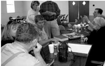
Below: Members of the Mobile Group.