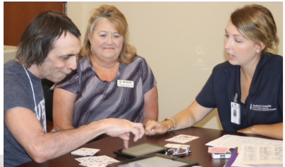
Above: Samford Speech Therapy students help a non-verbal AHIF client use an Amazon Fire Tablet as a communication device

The University of South Alabama Bright Ideas TBI Camp was held July 17-19, 2019. Students from Physical Therapy, Speech Therapy, Audiology, Nursing and Mental Health Counseling worked with TBI clients and caregivers from the Mobile area. Additionally, the camp offered music therapy and a nutrition presentation as well as an art therapy class taught by Alabama Family Respite Network.