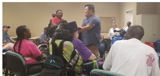
Above: Music Therapy at USA Camp