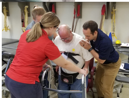
Right: USA Physical Therapy students work with a TBI survivor