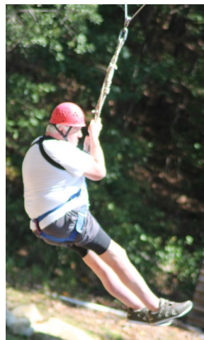
Zip-lining at Camp ASCCA