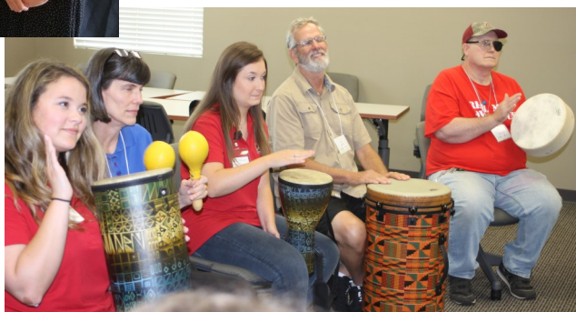
Right: Music Therapy students with campers