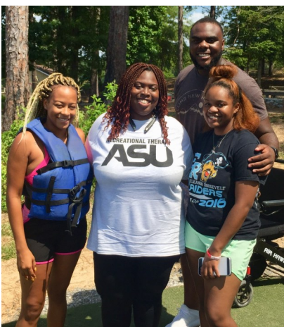
Student volunteers from Alabama State University