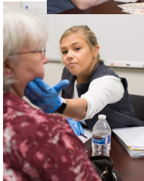
Left: Samford Speech Therapy student assesses a TBI survivor