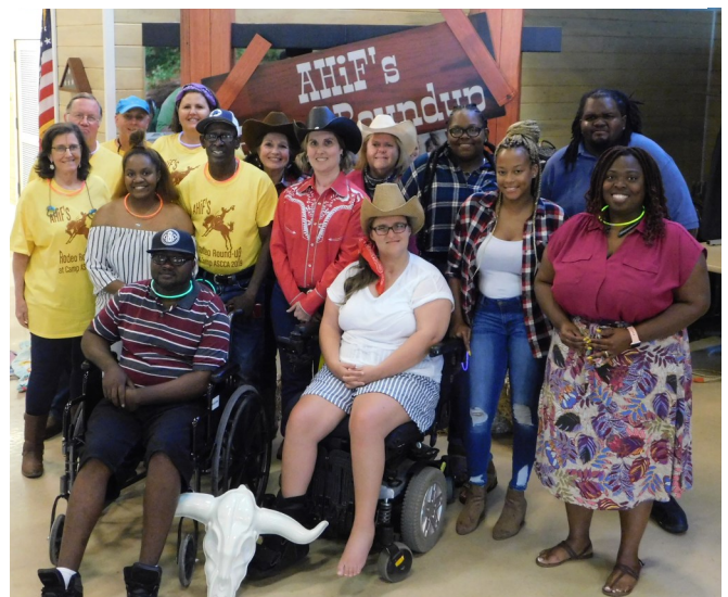
Celebrating the Rodeo Round-Up at TBI Camp!