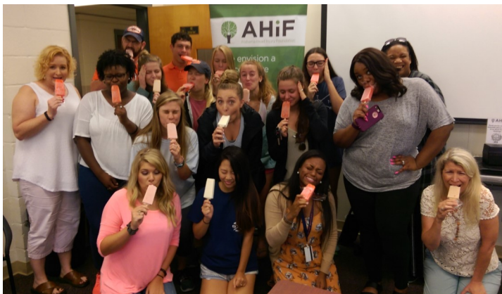
Auburn University—Rehab Counseling Program