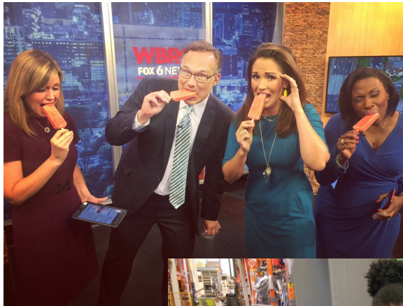
Fox 6 News

You can see more brain freeze pics at www.ahif.org or by visiting our First Giving page at www.firstgiving.com/ahif