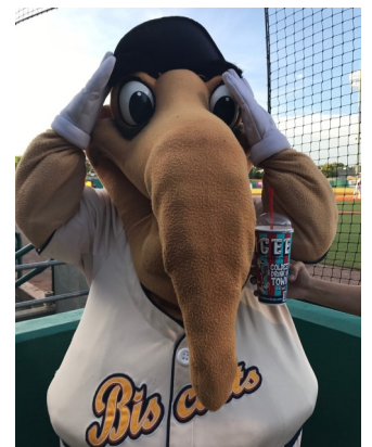
Montgomery Biscuits—Big Mo