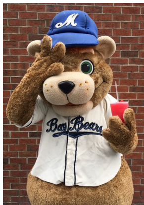
Mobile Bay Bears—Teddy